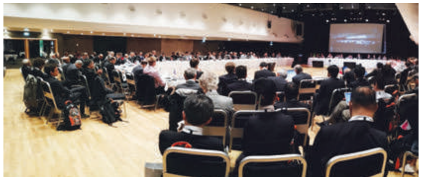
43rd ITA – AITES General Assembly in Session

For more information, visit http://www.seacetus2017.com/ ■